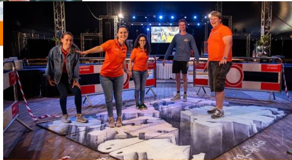
CURIOUSU 2019 AFTERMOVIE