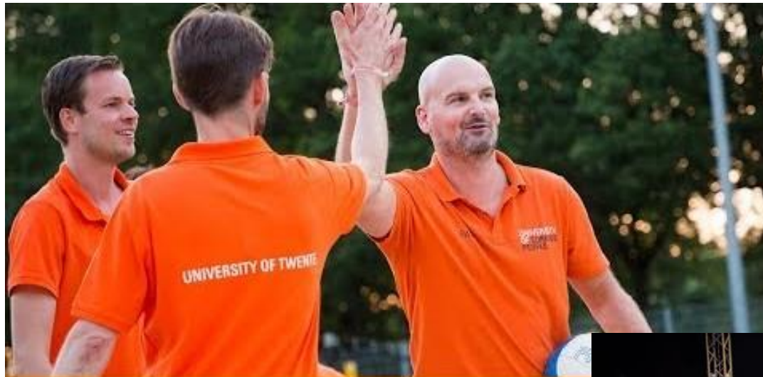
CURIOUSU 2018 AFTERMOVIE